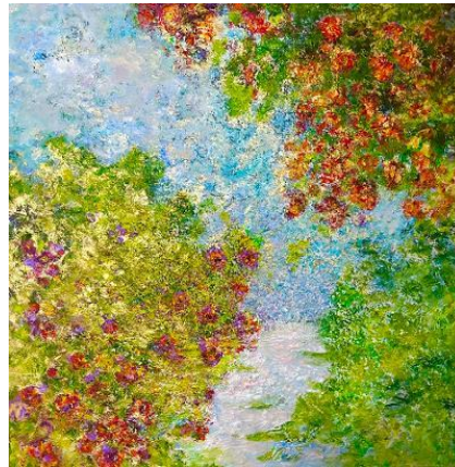
“When Hope Danced”