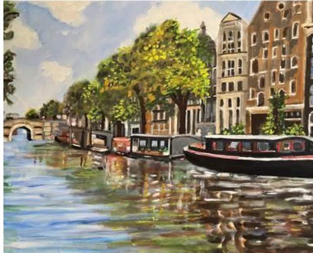
Amsterdam Acrylic, 30"x 24"