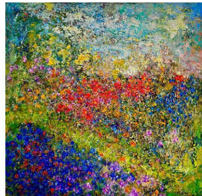
“Bow to Mother Nature”